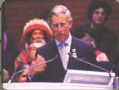
Prince Charles at the closing ceremony of Terra Madre