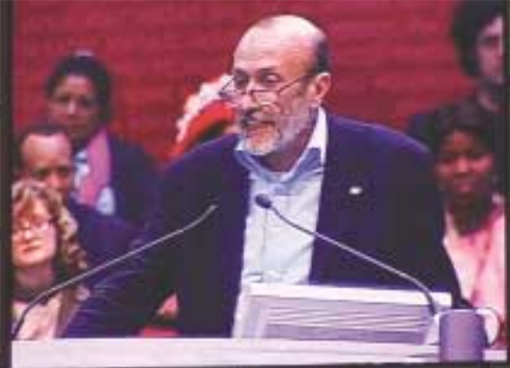
Carlo Petrini, Slow Food President