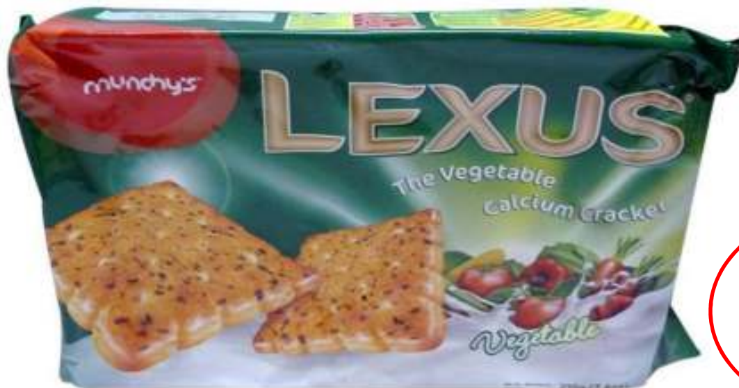
Malaysia: Munchy's Lexus The Vegetable Calcium Cracker.