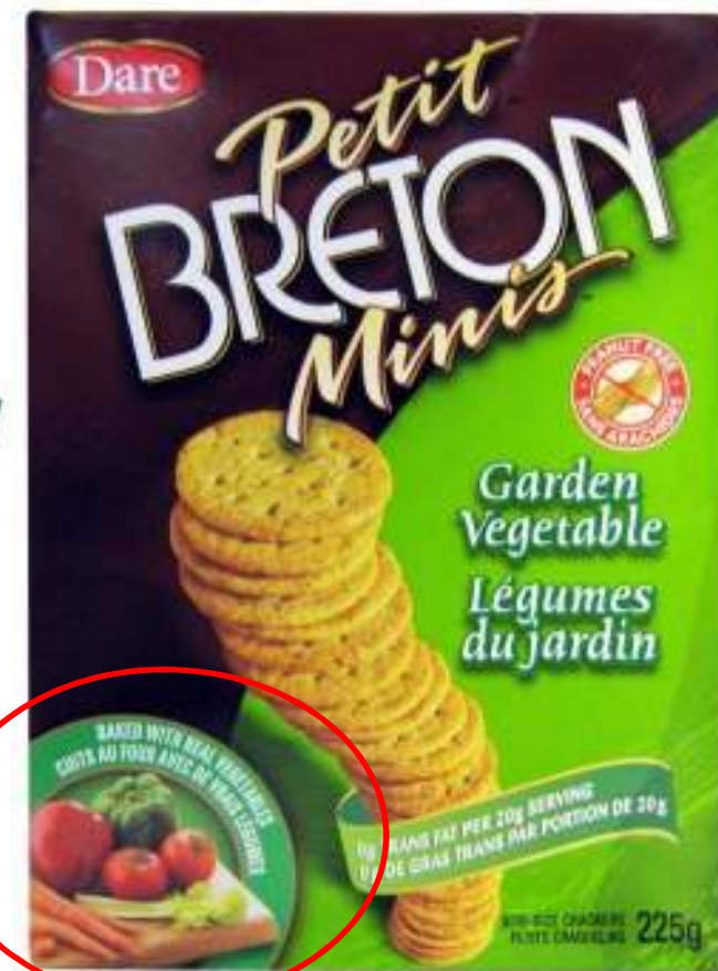
USA: Dare Petit Breton Minis Garden Vegetable Bite-Sized Crackers. Breton Minis Snack Crackers are perfectly bite sized so the whole family will enjoy the wholesome natural tastes. Baked with wheat germ and real vegetables. Source of iron and thiamine. No artificial colors or flavors.